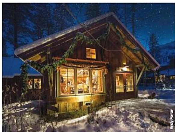
Sleeping Lady puts thought into every detail.

Or swing to Suncadia Resort, in Cle Elum, which has a big lodge with 250 rooms, as well as the Suncadia Inn, which has fourteen rooms and four large suites, and a smattering of cabins. When you show up to check in, you receive a "destination taste," a bite of locally sourced food, and it just gets better from there. With three golf courses, a full spa, scooters you can borrow and a 1,000-step staircase to a riverfront park, you're going to stay busy.