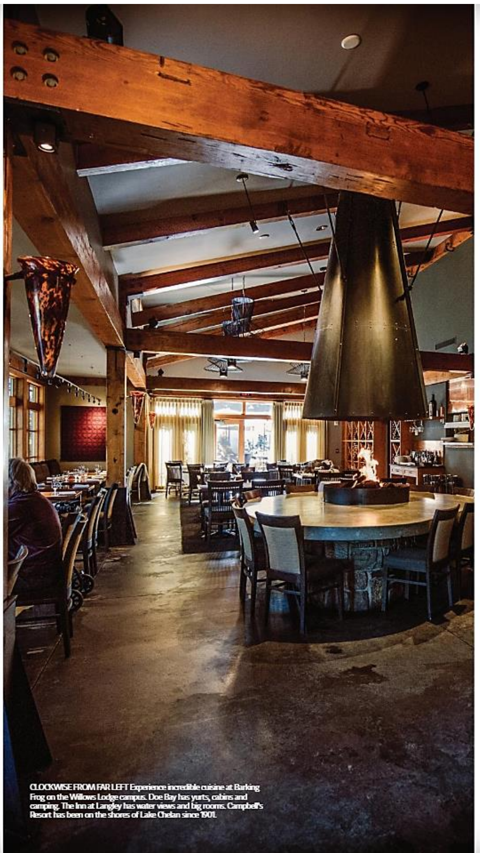
CLOCKWISE FROM FAR LEFT Experience incredible cuisine at Barking Frog on the Willows Lodge campus. Doe Bay has yurts, cabins and camping. The Inn at Langley has water views and big rooms. Campbell's Resort has been on the shores of Lake Chelan since 1901.

As for the Salish Lodge & Spa, it sits on the edge of Snoqualmie Falls. As though that weren't enough, it has a romance concierge who will help you turn up the love quotient on your next getaway. Dine in the dining room or at The Attic, where you can overlook the falls, and get ready for local food—the on-site apiary produces honey and homegrown herbs spice up all the dishes.